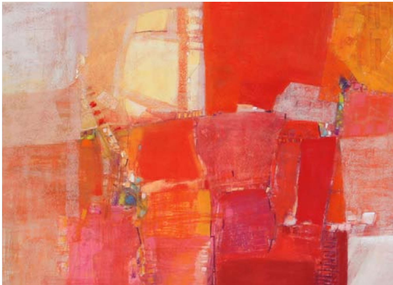
Red Series 4 (22x30)