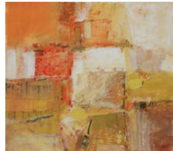
Gold Series 4 (20x22)