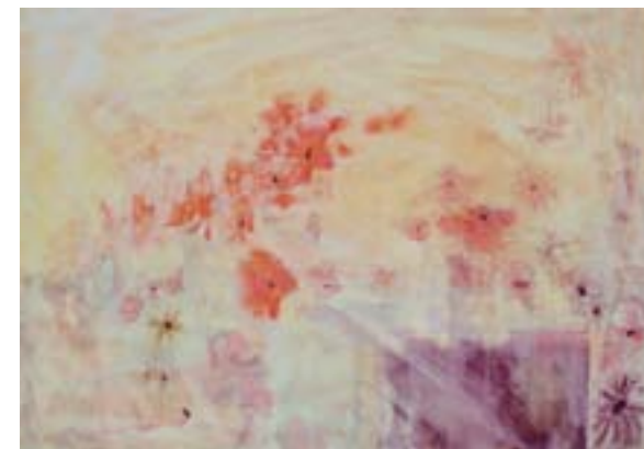
Flower Series 1